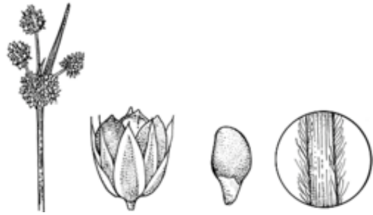
Line Drawings from PlantNET.

Species – densiflora. From Latin densus (adj.; combining form) = thick, close, dense + Lat. flora = flower, after Flora, the Roman goddess of flowers & spring.